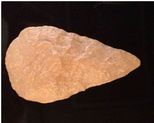
Figure 5-1: Handaxe, Western Desert, Egypt. Length 13.5 cm.

Stone handaxes (Figure 5-1) have been described as our “first standardized tool”, 1 the “longest-used tool in human history” according to the Wikipedia.