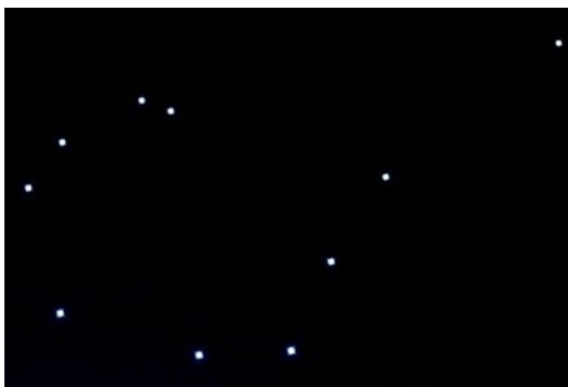
Figure 5-3: Present-day positions of the tail-stars in the constellation of Scorpio .

(The fact that some handaxes were actually used as tools is of no interest here, akin to the use of newspapers as packing material or bottle tops as gaming pieces.) But if this is correct, or even if not, an explanation would be required for the extraordinary longevity of the handaxe tradition. The manufacture of such objects, we might suspect, may belong among the initial conditions of our humanity. (Initial conditions commonly have long-enduring consequences as, for example, a person's genes or the educational level of his parents.)