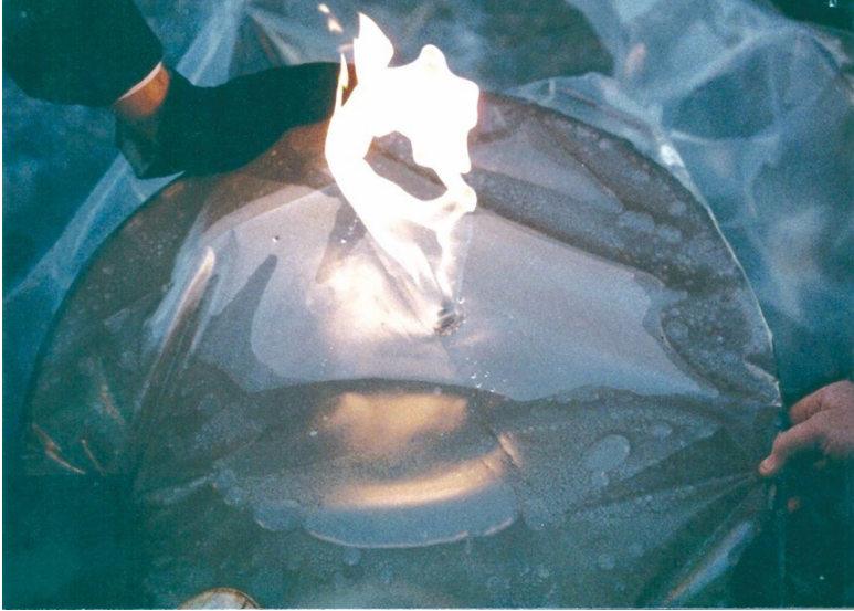
Figure 1-1: Siljan meteorite crater, Dalarna, Sweden, December 1984.