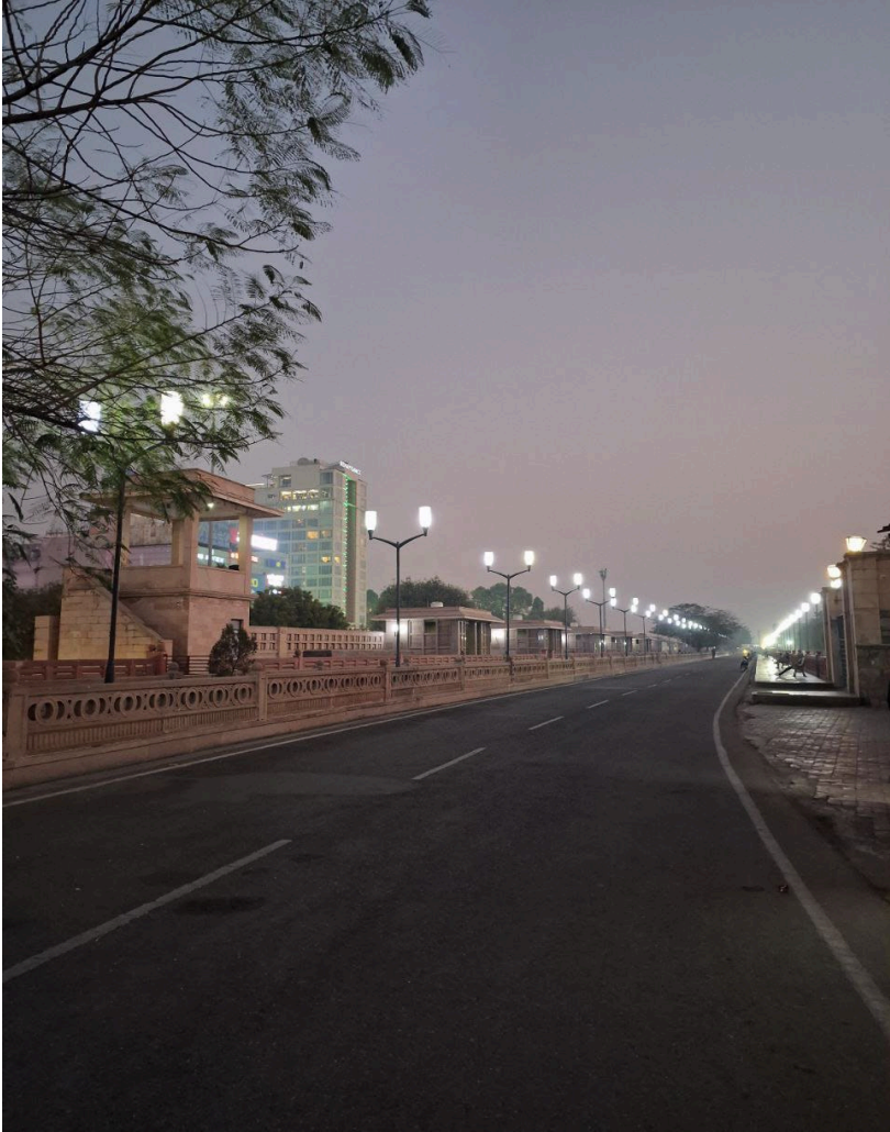
Fig 1-1 A glimpse of urban planning and transformation near the river bank area with environmental and transportation perspectives