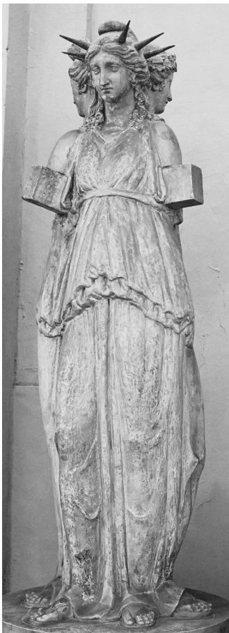
Fig. 1.4 Triple-formed representation of Hecate. Marble, Roman copy after an original of the Hellenistic period. Public Domain

Ancient pagan festivals survived in the public imagination due to their regularity and place within the calendar. They were mainly seasonal festivals, responding to the dying of the winter light, spring renewal, growth and harvesting of crops, and hunting of animals. The later fixing of the witch rites to Christian feast days, such as those in November, February, May, and August, was not a mockery or deliberate travesty of Christianity, but rather due to the fact that Christian feasts fell (or were made to fall) upon the same