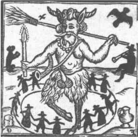
Fig. 1.5 Illustration from the title page of Robin Goodfellow: His Mad Pranks and Merry Jestes (1629). Public Domain.

were realities within the Christian Church. These demons or spirits were thought to ride out at night to perform blasphemous, lustful or vexatious acts. They sometimes appeared as werewolves or vampires, often riding broomsticks (although not until much later in England). Hanen (1900) suggested that witches flew to the sabbaths to avoid pursuit, whereas Robbins (1959) argues that the reported flying of witches was a method of manipulating evidence. If it was proven that a witch was innocently in one place, then arguments could be fabricated to show that she could almost simultaneously be some distance away causing mischief.