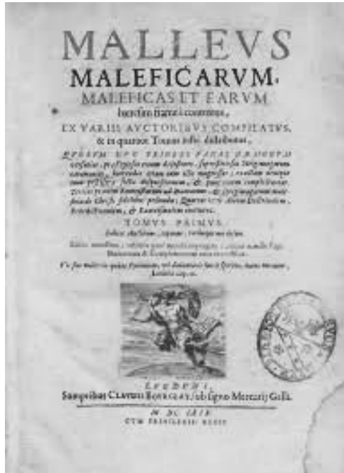
Fig. 1.2 Title page from a 1669 edition of the Malleus Maleficarum , a handbook on witchcraft originally published in 1487. Public Domain.

shaped by folkloric motifs, such as the idea of witches making pacts with the devil or engaging in shapeshifting.