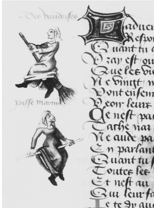
Fig. 1.6 Martin Le Francs. Le Champion des Dames . Public Domain.