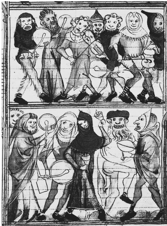
Fig. 1.1 A 14th century representation of the Feast of Fools. Public domain.

Many southern pagan fertility rites bore a resemblance to the later 'witch cults'. The rite of Dionysius incorporated frenzied dancing and song, ritual chaos, public sex acts and the consumption of raw meat. Although not directly linked, the later witches' sabbaths were supposed to demonstrate similar uninhibited debauchery. Elements of these practices continued openly into the Middle Ages in the form of the Feast of Fools which closely resembled the Roman Saturnalia.