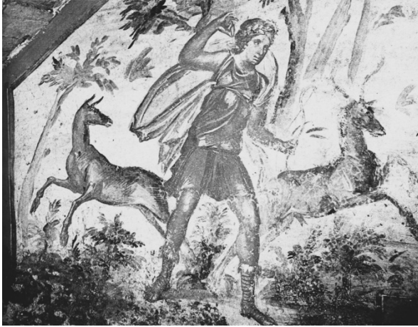
Fig. 1.3 Roman fresco depicting Diana hunting, 4th century AD, from the Via Livenza hypogeum in Rome.

connection with human menstruation also made Diana the guardian of fertility.