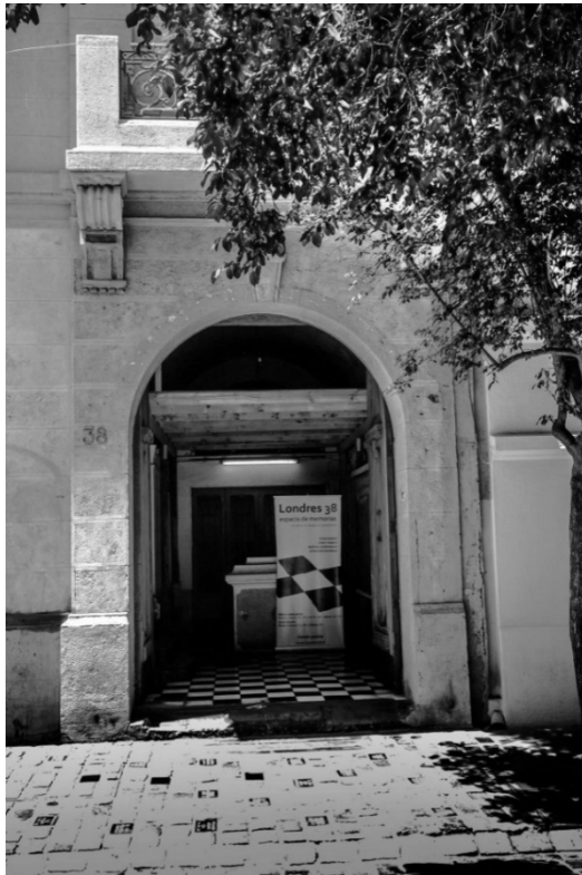
Illustration 1. The entrance to Londres 38 (Santiago de Chile).