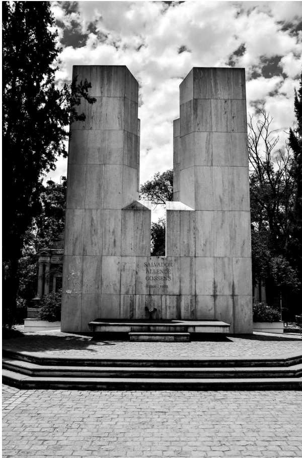
Illustration 5. General Secretary (Santiago de Chile) – Salvador Allende’s grave.

In 1990, thanks to the support of President Patricio Aylwin Azócar’s government, the Salvador Allende Foundation ( Fundación Salvador Allende ) was established. It was created at the initiative of the late president’s family and its first task was to organise the official state funeral of the president, who, having committed suicide on the day of the coup d’état, was buried namelessly in Viña del Mar, in the grave of the Grove family he was related to. He lay there for the whole period of Pinochet’s rule. President Patricio Aylwin and Eduardo Frei Ruiz-Tagle