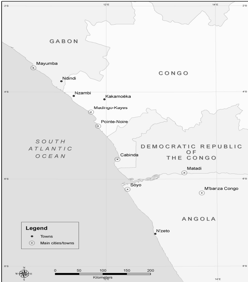
Fig. 1-2: Overview of the Bavili land (By A. van Niekerk for Ndinga-Koumba-Binza 2008)

To date, the dialectological system of Civili has not been the subject of any systematic study, except for very few attempts from Ndinga-Koumba-Binza (2000), Mabiala (1992) and Mavougou & Ndinga-Koumba-Binza (2010a). The attempt by Ndinga-Koumba-Binza (2000) is an overview of the dialectology of the language as it is spoken in the Republic of Gabon. Whereas Mabiala (1992) highlighted some aspects of the dialects of Civili as it is spoken in the Republic of Congo. These studies were undertaken on the basis of field observations. Mavougou & Ndinga-Koumba-Binza