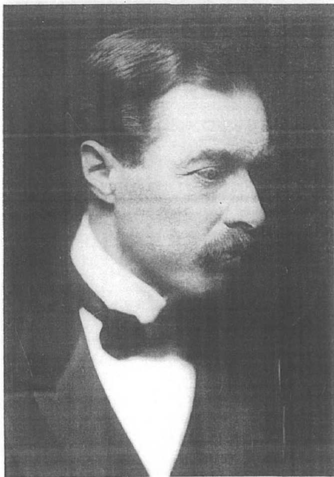
Sir Eyre Crowe