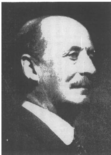
Charles Hardinge, Viceroy of India, 1910-1916, Permanent Under-Secretary at the FO, 1906-1910 and 1916-1920