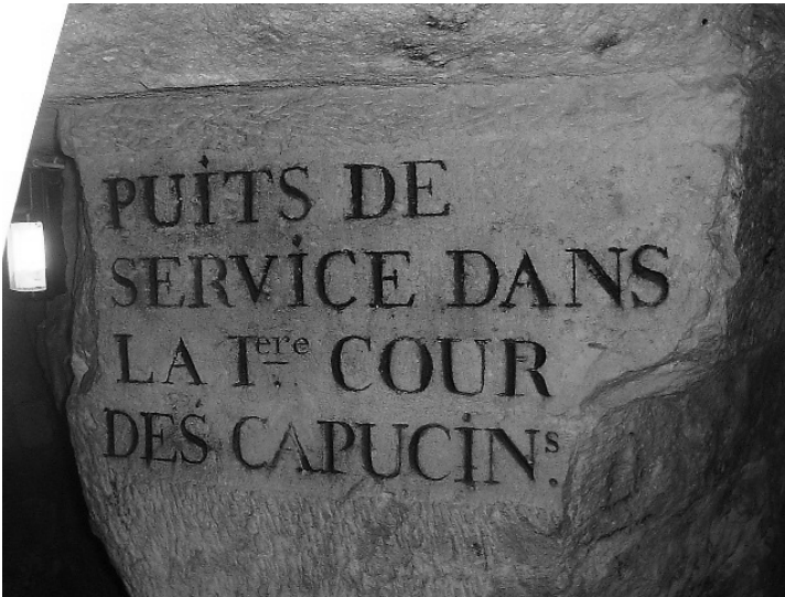
Fig. 2: The quarry works responsible for producing much of the official underground lettering were unfettered by preconceived notions of letter-carving. Word and letter spacing frequently caused problems and line lengths were often misjudged forcing the carver to render excess characters in a smaller size or place them indiscriminately on the stone.

The earliest marks were made by the quarrymen of the seventeenth century, and in the eighteenth century labourers working for the Inspection des Carrières added to these signs with thousands of instructional inscriptions necessary for the execution of their work: technical engineering marks and topographical indicators created with the aim of dating, referencing and directing the labour. 5