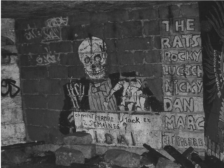
Fig. 5: A hand-painted sign, roughly executed, welcomes visitors to the Rats Bar, a small room used by cataphiles, and which derives its name from a popular group of cata-artists.

forays, for there is a peace and silence in the underground that provides a counterbalance to the rigours of the streets above. But whatever their reasons, it is the singularity of the place that is the greatest attraction and many cataphiles descend simply to ‘enjoy the ignored inheritance of Paris, which most people do not know exists and which few are privileged to have seen.’ 12