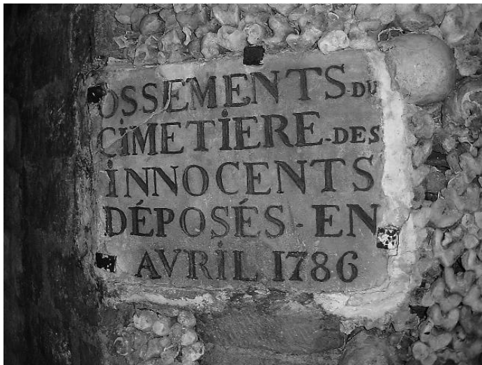
Fig. 3: A quarry-worker’s plaque commemorating the internment of the remains of over six million people who were removed to the underground from the overflowing Paris cemeteries in 1786.

curious gallery of vernacular interpretations on the Roman alphabet. 6 But the quarrymen did not simply make marks of necessity; they also made marks of fancy. ‘Liberty birds’ were drawn on the underground walls as rather poetic means of indicating exit points: the way the bird was facing showed the way out. The notion of the ‘liberty bird’ came from the early navigators who longed for the sight of a bird to indicate the approach of land and as many of the quarrymen were ex-seamen, they adopted this symbol to indicate the exit from the underground and thus freedom from the quarry.