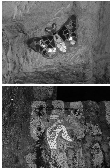
Figs. 6 & 7: Ceramic images of bird and butterflies are popular symbols in the underground: symbols of freedom in a confined and restricted space.

environment that encourages introspective and very personal paintings on subjects that are always extraordinary and frequently bizarre: monsters and beasts, phantoms and ghouls are favourites; futuristic topics recur; and politics, religion and sex inevitably find wall space. The painters produce work that is highly stylized and graphic and which has been inspired by many genres: some have adopted the manner of comic-book art; others have been stimulated by Egyptian hieroglyphics or North America Indian symbols; punk has had its influence; whilst classical art has shaped other paintings. Some of the art is purely decorative, and colourful geometric shapes abound. The sculptors and ceramicists choose gentle themes and are often influenced by architecture and produce work inspired by masons of an earlier age. Alternatively, fantastic and mysterious creations of the imagination result in whimsical castles or extravagant gargoyles. The mosaic artists create the most delicate work in the quarries and their small pieces of coloured glass and stone are used to produce charming birds, butterflies and flowers.