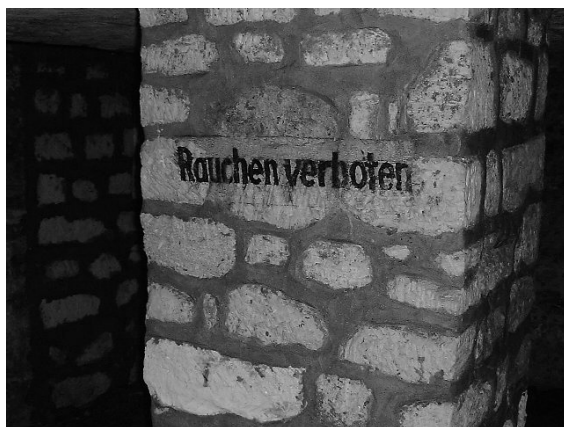
Fig. 4: One of many signs left in 1940-44 by occupying German forces. They are among the most methodical and considered signs in the quarries.

Whilst the Germans requisitioned the northern end of the underground, the Free French of the Interior (FFI) found sanctuary in the south of the network just below the Place Denfer-Rochereau in a shelter (now known as 'Abri FFI'), which was fully furnished and equipped with all the material necessary to sustain a long-stay headquarters. It was from here, in 1944, that Rol-Tanguy, Head of the FFI of the Ile-de-France, directed the liberation forces. In the same year, the Inspection Générale des Carrières was instructed to convert another area of the quarries into habitable safe-houses for the collaborators Pierre Laval, Fernand de Brinon and Heinrich Otto Abetz. Posthumously named 'Abri Laval', the area was completed just days before the liberation and never gave shelter. However, the rooms of the Germans, the FFI and the collaborators still stand and their crumbling furnishings remain as a testimony to the past and are bespattered with the political graffiti of the present.