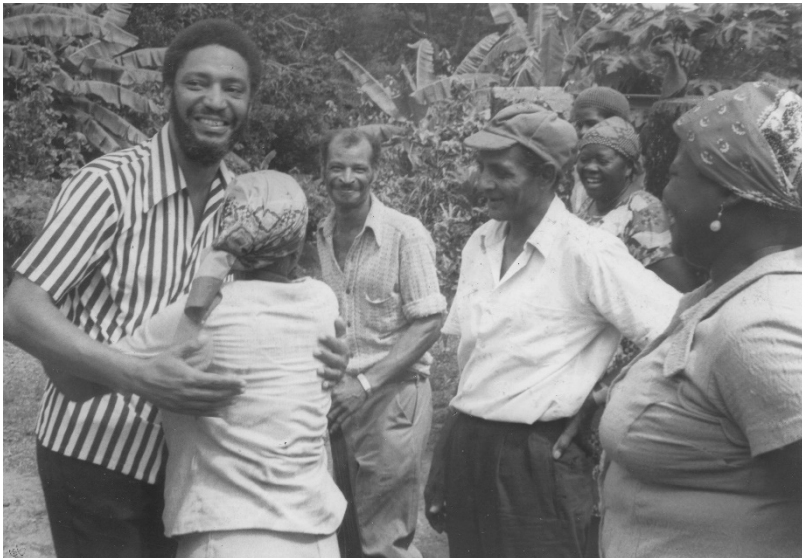
Fig. 1-6 Maurice Bishop at La Force Estate (GNM)

For the Grenada Revolution, it would take much longer before differences surfaced and affected the course of the Revolution, ultimately derailing it. The immediate success of the revolution brought people together as the tasks at hand required that unity, and things went well for at least the first two years. Though numerous analyses of the demise of the Revolution point to ideological differences between PM Bishop, his Deputy Coard and their allies as the primary cause of the rift between them, others contend that it was more about personality differences. Maurice Bishop, charismatic, handsome and congenial, immediately became the popular leader of the Revolution and loved by everyone. His laidback, outgoing style and desire to please everyone contrasted with Coard's discipline, organized, often undiplomatic and straight forward approach towards everything. This brought them into contention as Bishop was often criticized for not adhering to decisions taken through consensus. It may have been a case more of wanting to be all things to everyone than just going against the decisions of the party, but it was an issue that vexed the members of the Central Committee.