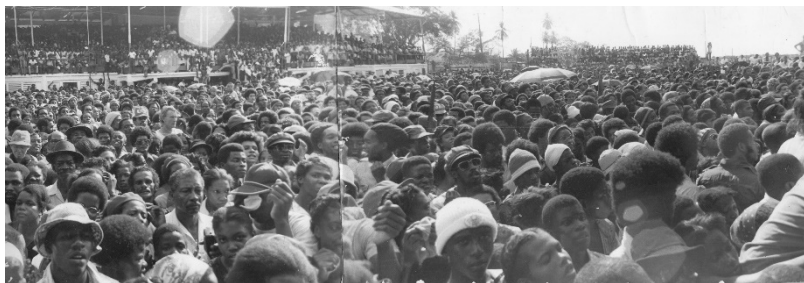
Fig. 1-4 First rally after the Revolution, March 1979 (GNM)

challenged the colonial system and radically altered the course of the country with his mass revolt in 1951 and Independence in 1974, the NJM advocated more drastic changes so that a larger portion of Grenadian society, which had been exploited since slavery, could benefit. 17