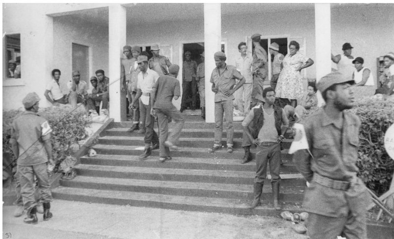
Fig. 1-3 Radio Free Grenada on the morning of March 13, 1979 (GNM)

that tackled many issues plaguing Grenadian society, with the goal of dramatically altering it to the benefit of “the masses.” The four-and-a-half years old Grenada Revolution enjoyed initial successes, stemming from the exuberance among Grenadians who, for the first time, felt that they were part of something special and larger than themselves. Foreign workers, realizing the dream of a socialist revolution, flocked to Grenada to give of their energies and contribute to the Revolution (see Fig. 1-4, 1-5, 1-6, 1-7). Confronted with growing internal opposition from critics, some of them former supporters and members, the PRG responded by arresting many as “counter revolutionaries,” even incarcerating Rastafarians at a re-education camp for illegal drug production. 9 Added to this were economic, structural and political pressures, especially from the United States government which viewed Grenada as a threat to stability in the region.