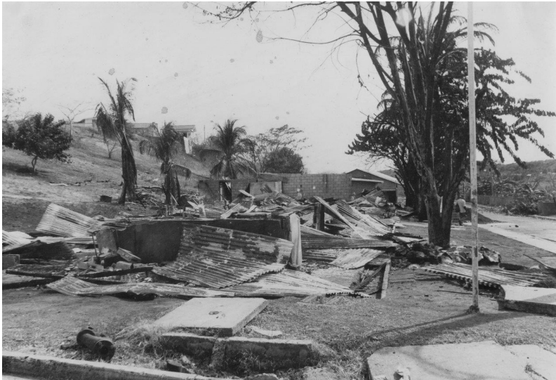
Fig. 1-2 Military barracks at True Blue, St. George after being attacked and burnt on March 13, 1979

that they had no option but to act immediately, having received reliable information that Prime Minister Gairy had left orders to have its leadership “silenced.” The NJM called on members of the Gairy government to surrender, and all police stations to do the same by hoisting a white flag. By the end of the day, the NJM was in full control of the islands, staging a successful, armed overthrow of the elected Gairy government it had opposed for almost a decade (see Fig. 1-3). Though taken by surprise, a large segment of Grenadian society welcomed the coup, and the NJM soon gained widespread local and international support. 8 The rule of the Eric Gairy government, characterised by corruption and mismanagement, had brought the country to the brink of political and financial bankruptcy, and many saw the People’s Revolutionary Government (PRG) as a positive force to bring about needed change.