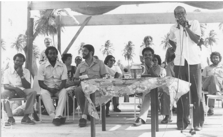
Fig. 1-5 Second rally after the Revolution, 1979 (GNM)

In the case of the NJM, external influences were a major stimulus, beginning with the ideology of its members. In the early 1970s, it was Maurice Bishop, Unison Whiteman, Bernard Coard and others, returning from studies in the UK and the US with new ideas of politics and government, who embarked on creating social movements to challenge what they saw as colonial exploitation of the masses. Premier Gairy, however, saw them differently: "These irresponsible malcontents, these disgruntled political frustrates coming from abroad,... coming here, metaphorically and literally hot and sweaty, and shouting 'Power to the People.'" 24 They returned influenced by the Cuban Revolution, the ideology and economics of Socialism, and other anti-colonial struggles across the globe, particularly in Africa, even the Black Power and Civil Rights movements in the US and Canada where Caribbean nationals were heavily involved. These struggles reverberated throughout the English-speaking Caribbean and threatened the political status quo in the region as was the case in Trinidad in 1970, with Premier Gairy using it as a cautionary tale when he said "When your neighbours' house is on fire, keep on wetting your own house." 25