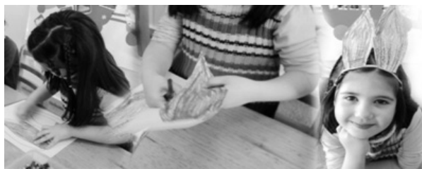
Figure 1-2: A student coloring, cutting, and presenting the project "Bunny Ears"; from the researcher's record, Creativus/2012.

For example, children could make their own picture books for storytelling, paper animals for games, "a seasons circle" for vocabulary practice, puppets and masks for drama and role-play, and many more. When planning a creative activity, it is essential that teachers themselves try it out first. They should also not expect works of art from the students (although we may as well get some), but always keep in mind that it is the process that is important, and the language used (Phillips 1993, 114). Project work is very helpful for the development and assessment of the students' speaking skills, since teachers usually ask children to explain what they are doing or to describe the very end-product.