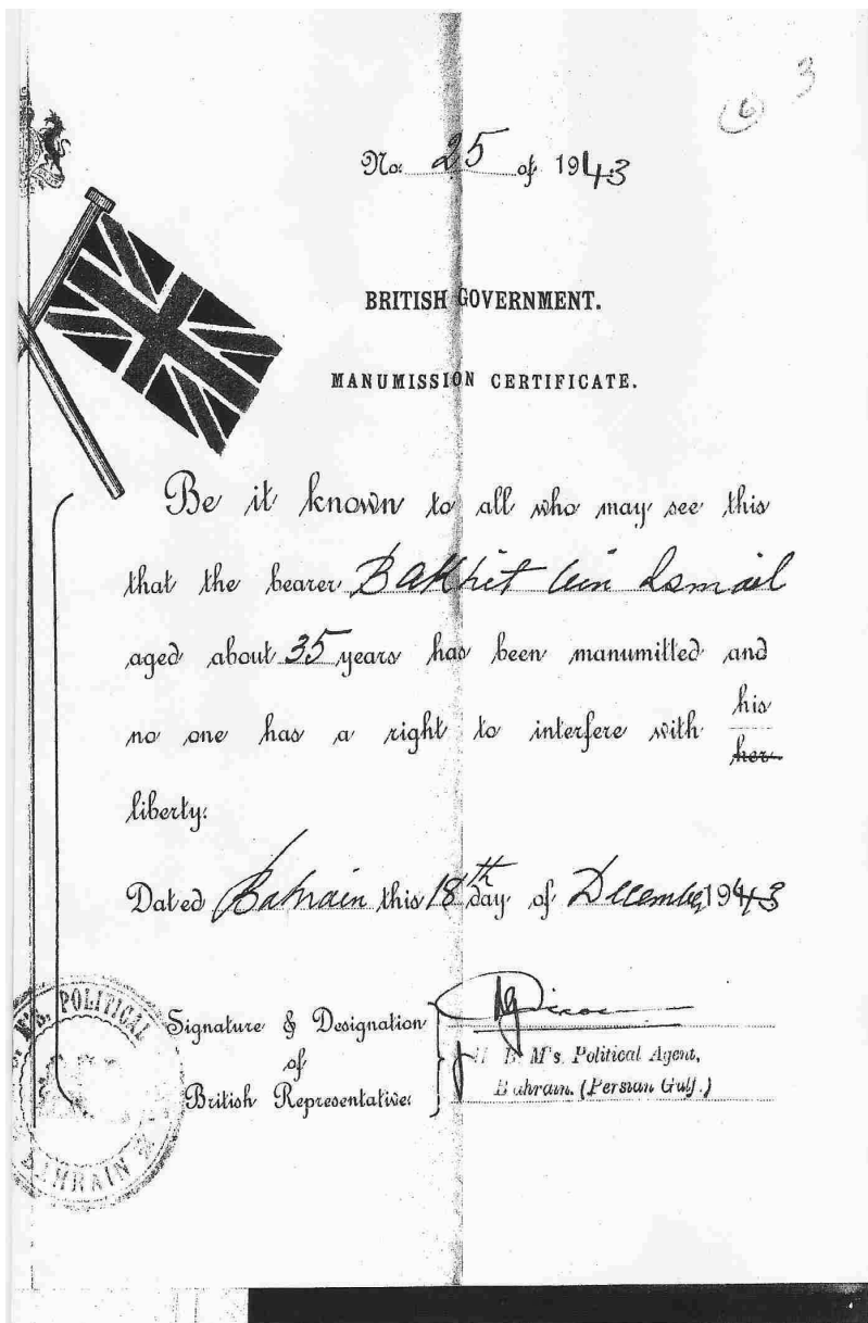
The same certificate - English part