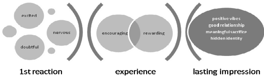
Figure 2: Three Phases of Immersion in Academic Blogging

Figure 2 maps out a framework to describe the academic blogging experience among ESL learners engaged in http://www.speakup-avenue.blogspot.com . Based on the reflective journals, semi-structured interviews as well as content analysis of blog commentaries from the learners, it can be said that the ESL learners who participated in the study exhibited three predominant stages of acceptance and reaction to the academic blogging immersion. The phase begins with random first reaction followed by engagement with the academic blogging process where they experienced the interactive nature as well as the benefits of academic blogging. Having gone through the process, the learners captured some lasting impressions with regards to the introduction of academic blogging in ESL classrooms.