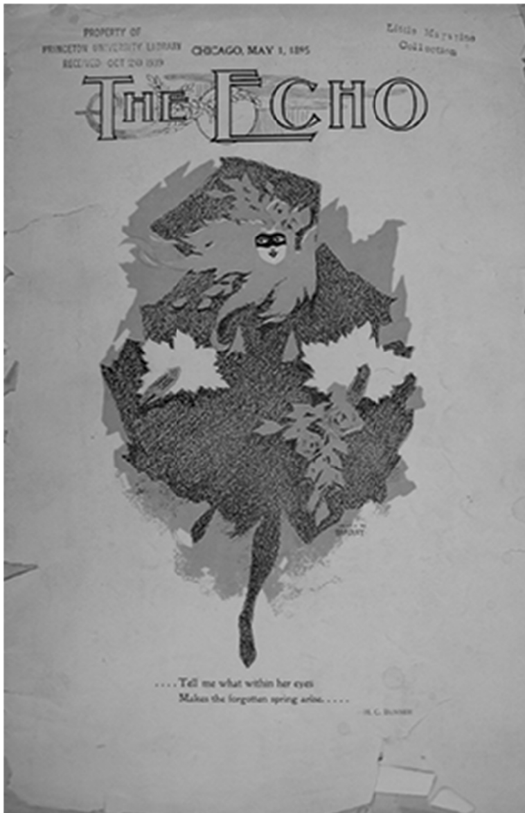
Fig. 2 Will Bradley, cover design for The Echo . May 1, 1895. Courtesy Princeton University Library Special Collections.