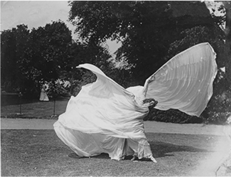
Fig. 4 Loïe Fuller dancing, ca. 1900, a photograph by Samuel Joshua Beckett that had been in the possession of the sculptor Theodore Rivière. The Metropolitan Museum of Art. Gilman Collection, Purchase, Mrs. Walter Annenberg and The Annenberg Foundation Gift, 2005. www.metmuseum.org .

The artworks associated with the bibelot network, as suggested by three examples from The Chap-Book , can be seen to be grappling with the paradoxical problem of representing “circulation without motion”: a series of images of the American dancer, Loïe Fuller, who was enjoying a meteoric stint in the Parisian cabarets with her development of a dance form that put light in motion; the publication of French symbolist poetry by both Verlaine and Stéphane Mallarmé; and the serialization of What Maisie Knew . In each instance, the paradox of representation swirls around the problem of the artistic rendering of the relation as it multiplies over time. Loïe Fuller’s success in the Parisian cabarets in the early 1890s generated a swarm of interest in her work among the American bibelots, and nowhere is this more apparent than in the early numbers of The Chap-Book shortly before its publication of What Maisie Knew . Fuller is known for the dances she developed at the Folies Bergères, especially the Serpentine Dance and the Fire Dance, in which a central torque of her body sent yards of silk expanding into the periphery, lit from underneath