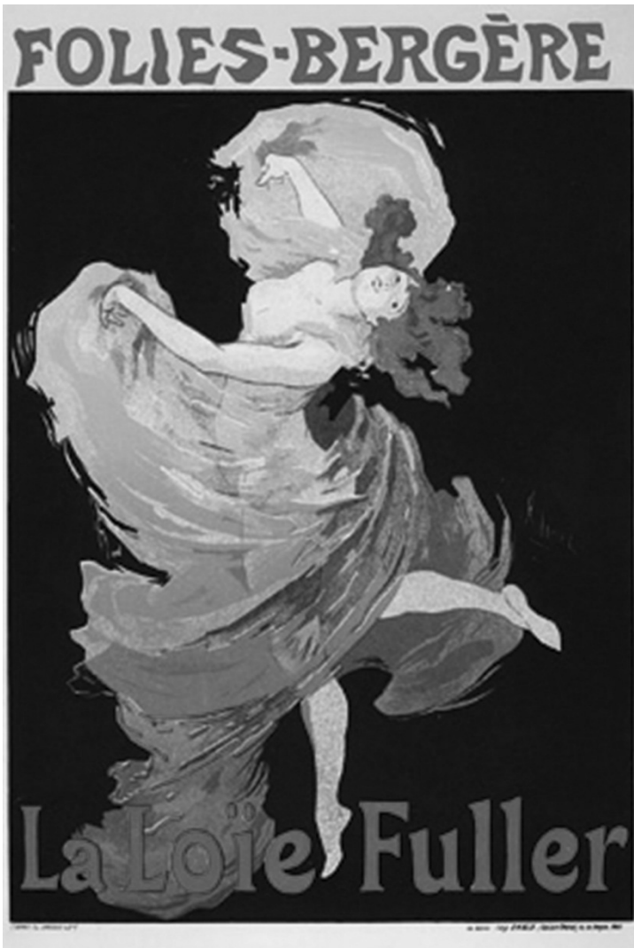
Fig. 5 Jules Cheret, poster featuring Loïe Fuller at the Folies-Bergère. 1893. Lithograph, printed in color, 48 ½ X 34 ½" (123.2 X 87.6 cm). Acquired by Exchange. The Museum of Modern Art, New York, NY, U.S.A.