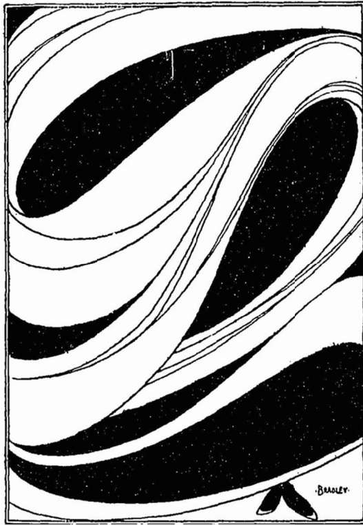
Fig. 8 Will Bradley, “The Serpentine Dance,” published in The Chap-Book 2:2 (December 1, 1894), 62. Public domain.

same language that Mallarmé uses to describe the ballerina, William James compares the stream of our consciousness to a bird’s life with “an alternation of flights and perchings,” where the stream is like the flight “filled with thoughts of relations” (159, 160). Bradley’s illustrations seem to struggle to come to terms with such relations, to the visual description of the conjunctions between Fuller’s poses. They are a visual register of William James’s transitive mode, and like James we might say that the images register “a feeling of and, a feeling of but, and a feeling of by, quite as readily as . . . a feeling of blue or a feeling of cold” (162). When James goes on to describe the “feelings of relation” in terms of “psychic overtones, halos, suffusions, or fringes,” we might be led to wonder what the stream of consciousness is, after all, if not Bradley’s depiction of Fuller’s serpentine dance (168).