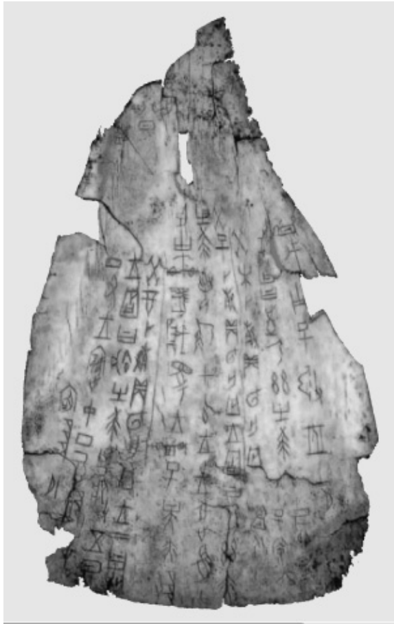
A sample of Oracle Bone Text (on ox bone)