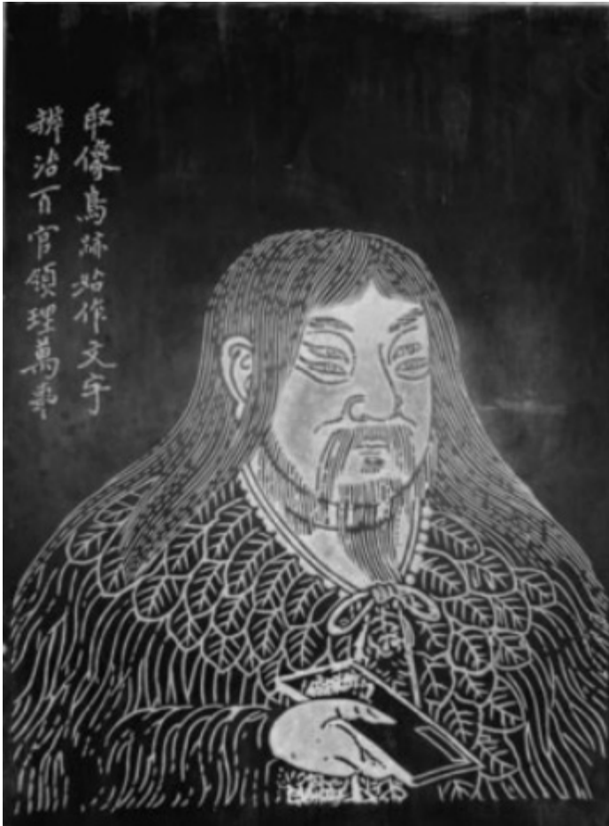
An ancient drawing of Cang Jie, the legendary maker of Chinese characters

standardizing the characters that had been created and used earlier by a group of people, simply for the reason that the whole writing system of such a complicated language as Chinese could hardly be “made” overnight by a single individual and directly accepted by the whole society. More reasonably, the “creation” of Chinese characters would have been the result of collective efforts, through a long period of trial and improvement. Through research, modern specialists have found that one way the ancestors of the Chinese people used to record events was to tie knots in a rope, and