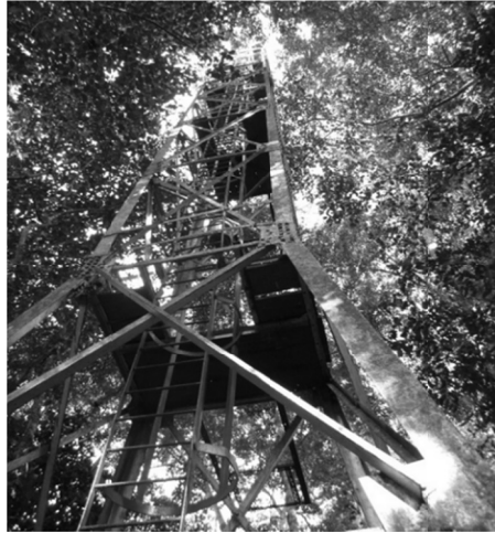
Fig. 1.3. Zika tower in the Zika Forrest, near Entebbe, Uganda

In 1947, scientists first identified the virus in a rhesus monkey in the Zika forest near Entebbe, Uganda 4 on the northern shore of Lake Victoria. The febrile rhesus monkey had been caged in the forest canopy as a sentinel for a yellow fever study (Fig. 1.3).