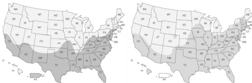
Fig. 1.6. Estimated range of Aedes aegypti (left) and Aedes albopictus (right) in the United States, 2016.

during adverse conditions in inter-epidemic periods. To date, vertical transmission of Zika virus has not been observed in field-collected mosquitoes. Therefore, the epidemiologic importance of these laboratory observations is yet to be determined.