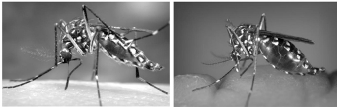
Fig. 1.2. Mosquito vectors of Zika virus. Left image, Aedes aegypti ; right image, Aedes albopictus

It is closely related to dengue, yellow fever, Japanese encephalitis, and West Nile viruses and is transmitted primarily by mosquitoes, chiefly by Aedes aegypti and occasionally by Aedes albopictus (Fig. 1.2).