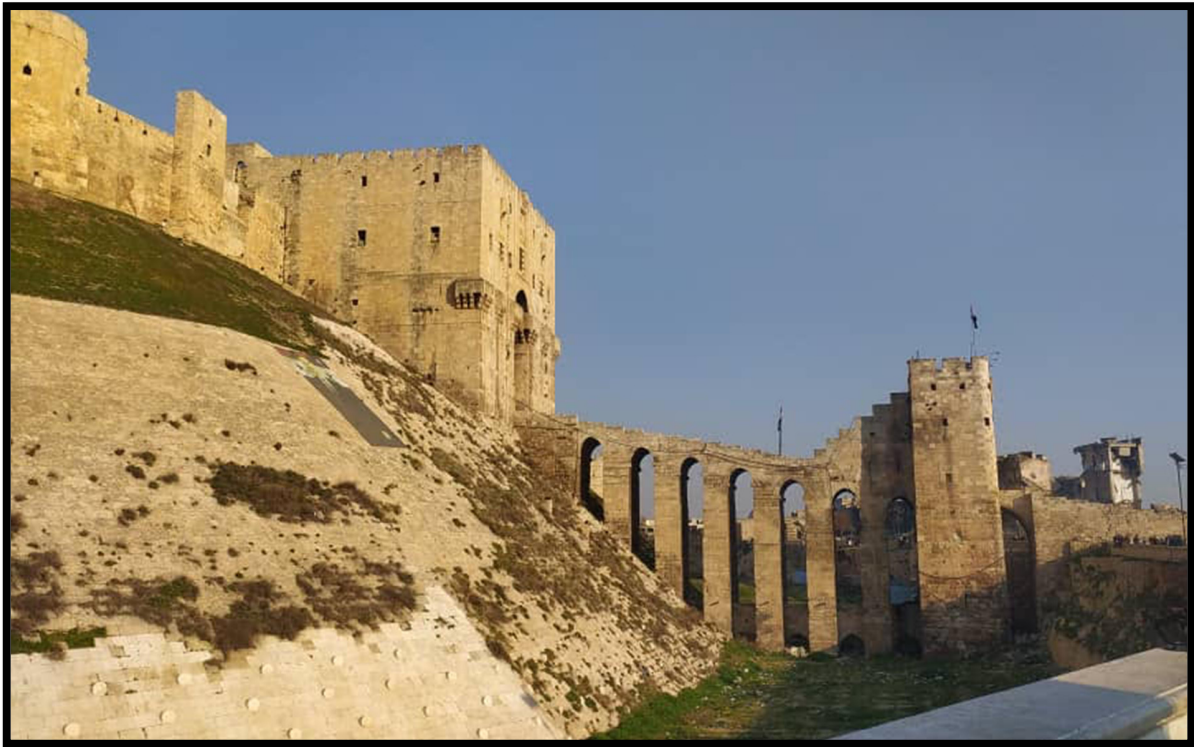
Image 0.2 Aleppo Citadel Sideview