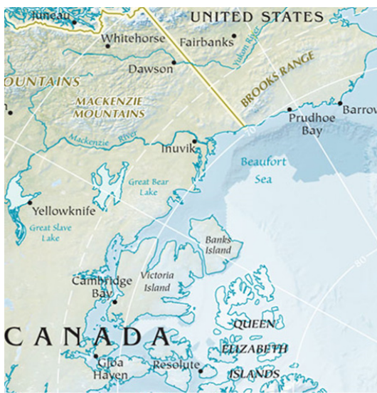
Figure 2 Western Arctic Islands & Alaska

We did our first testing at Yellowknife in the early spring of 1972 and soon moved on to Tuktoyaktuk (or Tuk) where we were mobilized via helicopter to a test site approximately 50 miles offshore. We were ferried to the test site by a Sikorsky S-68 helicopter each day and ferried back at night. One afternoon a white-out occurred and the pilot informed us we would be staying on the ice with the helicopter for the night. It was -40 C that night and the inside of the helicopter iced from breath moisture and became much like an icebox. It was warmer outside. Fortunately, Sun Oil had a small, heated building at the site to house recording instruments, so we could take turns going in there and get some hot soup or tea. We had a Herman Nelson oil fired heater but that was reserved to warm the helicopter engine whenever the weather cleared enough to let us leave. Fortunately, the weather cleared the next morning and we were able to leave. We did have drums of jet fuel aboard and the pilot warned us not to smoke while we were sitting in the back of the helicopter during flight, or any other time! Now HSE procedures would not even allow us to fly in any aircraft carrying drums of fuel. We all got back to Tuk that day and had a nice warm supper in camp.