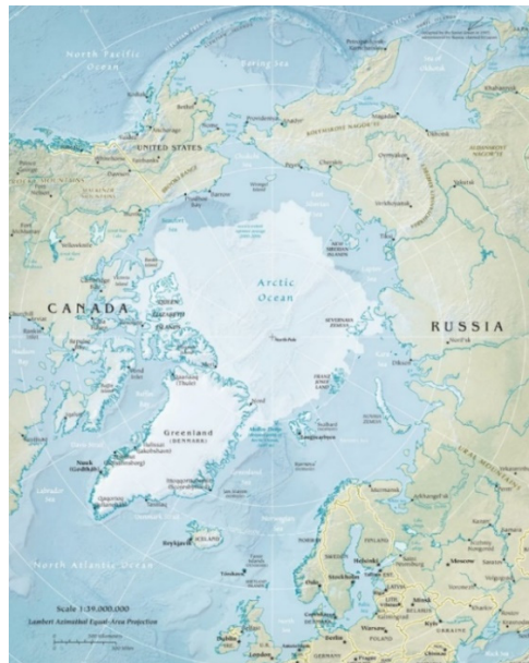
Figure 1 N Polar Region