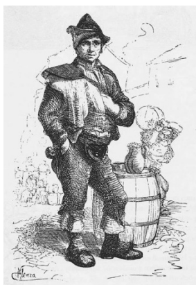
Fig. 1-3 28

On the left one can see the Spanish original taken from the sketch collection “Los españoles pintados por sí mismos”, on the right appears the Mexican version.