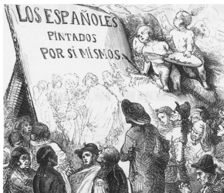
Fig. 1-1 23