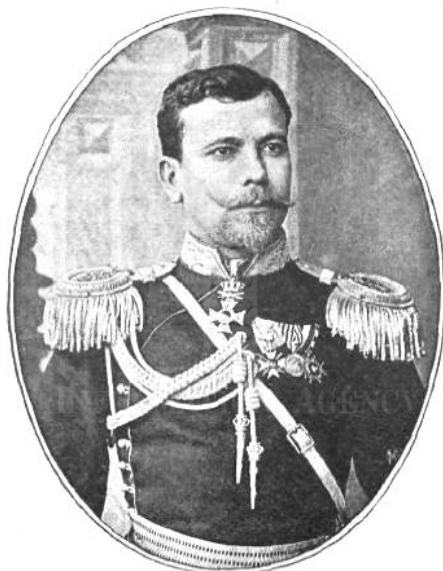
Подполковникъ Михаилъ П. Саввовъ Министръ на Войната.

Colonel Mihail Savov, the Minister of War of Bulgaria