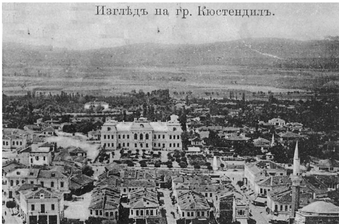
A view of Kyustendil (Aug. 1903)