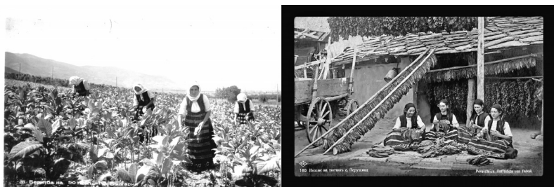
Harvesting and stringing tobacco leaves