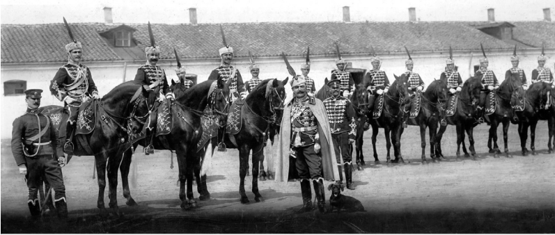
Officers of the Life Guard Cavalry Squadron – the escort accompanying and guarding the Bulgarian Head of State

Two days before the catalogue was published, however, The Era presented (on 2 January 1904) the same film, revealing its contents in detail: ‘The first section shows a fine portrait picture of M. Savoff, and his staff, chatting and smoking. The next picture was secured in the Barracks inclosure [enclosure] at Doubnitsa [Dupnitsa], and depicts the regiment of Bulgarian Troops lined up for inspection, while the Minister of War and his Staff Officers are seen issuing orders to the Commanders. The troops swearing loyalty to their country. The last section shows the march past of the Body Guard, a squad of men of great physique and fine bearing, carrying the conviction of well-drilled soldiers.’ 8 It is obvious that The Era described the film in a detailed and different way. Not only because the minister and his staff were ‘chatting’ and ‘smoking’ – within the ‘fine portrait picture’, not only because the last sentence was not changed, but because it turned out that the ‘inspection’ was carried out not on an ordinary military ground in Samokov, but ‘in the Barracks inclosure [enclosure] at Doubnitsa!’ A totally new detail appeared (most unexpectedly) – ‘The troops swearing loyalty to their country’!