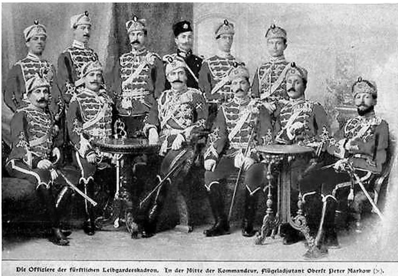
‘Bulgarian Life Guard Cavalry Squadron Officers, 1903’