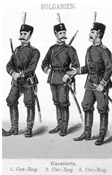
Bulgarian cavalry uniforms

Moore convinced himself in the proficiency of ‘the little mountain battery’ nearly half a year before Charles Noble. What he wrote shows that the interest in the battery of Minister Mihail Savov, who brought his important retinue and even an English cameraman with himself, was probably not just because of the military inspection. The reason for the visit could be the already mentioned ‘sympathy with the work of the insurgents’, which concerned the Palace, the government and the Supreme Army Command. That benevolent attitude, which often expressed itself in providing actual material support, must have made Colonel Savov ask ‘the soldiers about their lives in the barracks, the food, the clothes and their military spirit’!