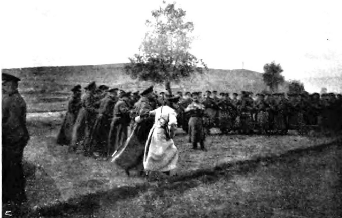
DANCING THE “HORO.”

“If there is only war next year,” piously responds Jimmy.’ 10